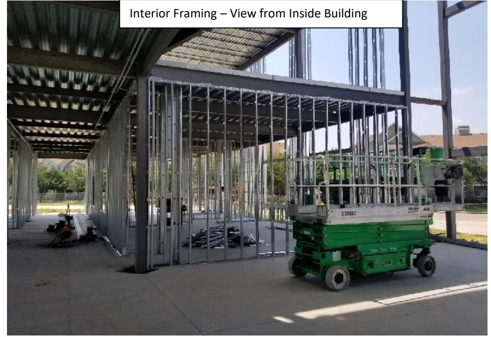
Interior Framing – View from Inside Building