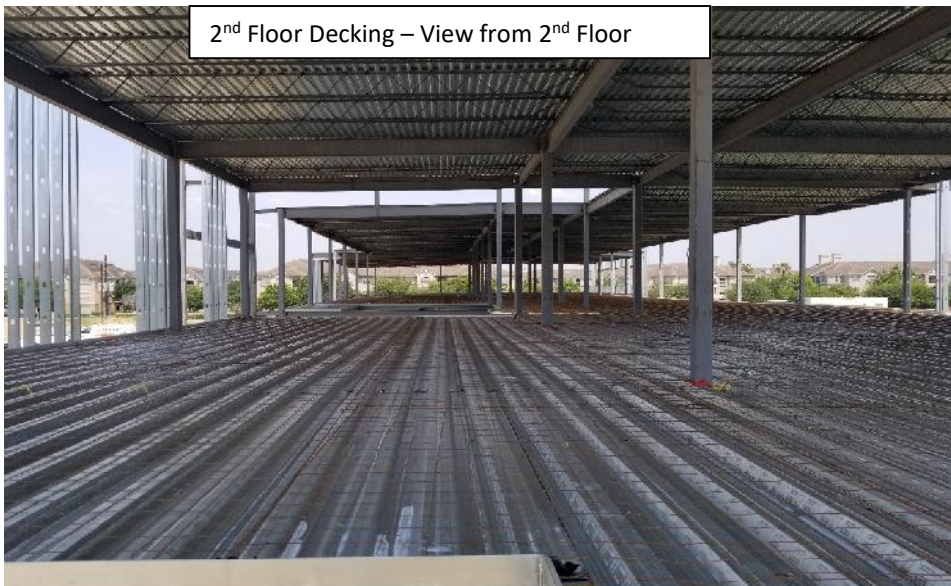
2 nd Floor Decking – View from 2 nd Floor