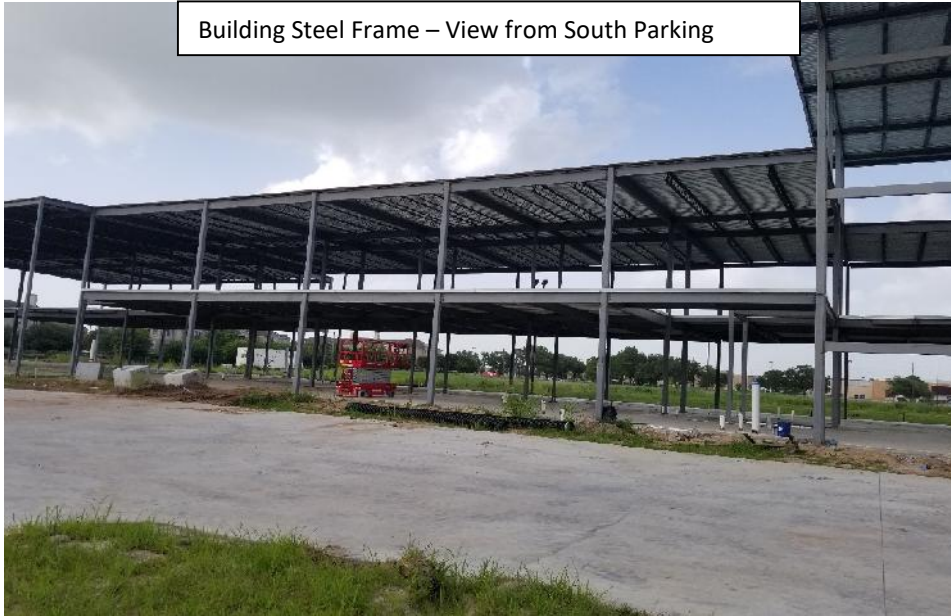
Building Steel Frame – View from South Parking