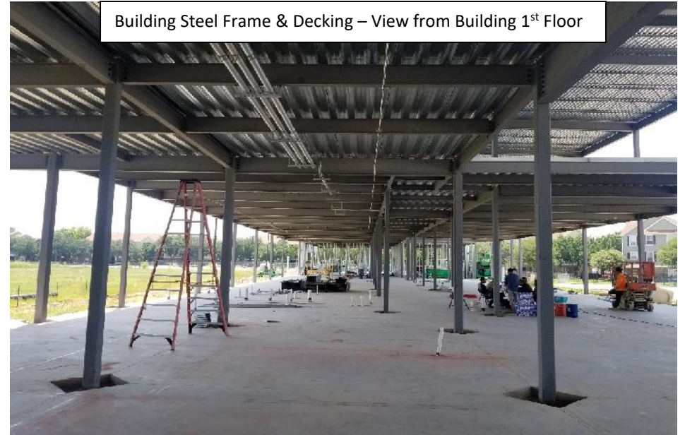
Building Steel Frame & Decking – View from Building 1 st Floor