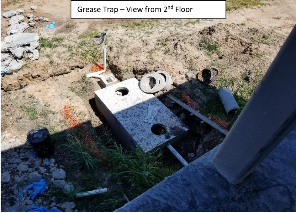
Grease Trap – View from 2 nd Floor