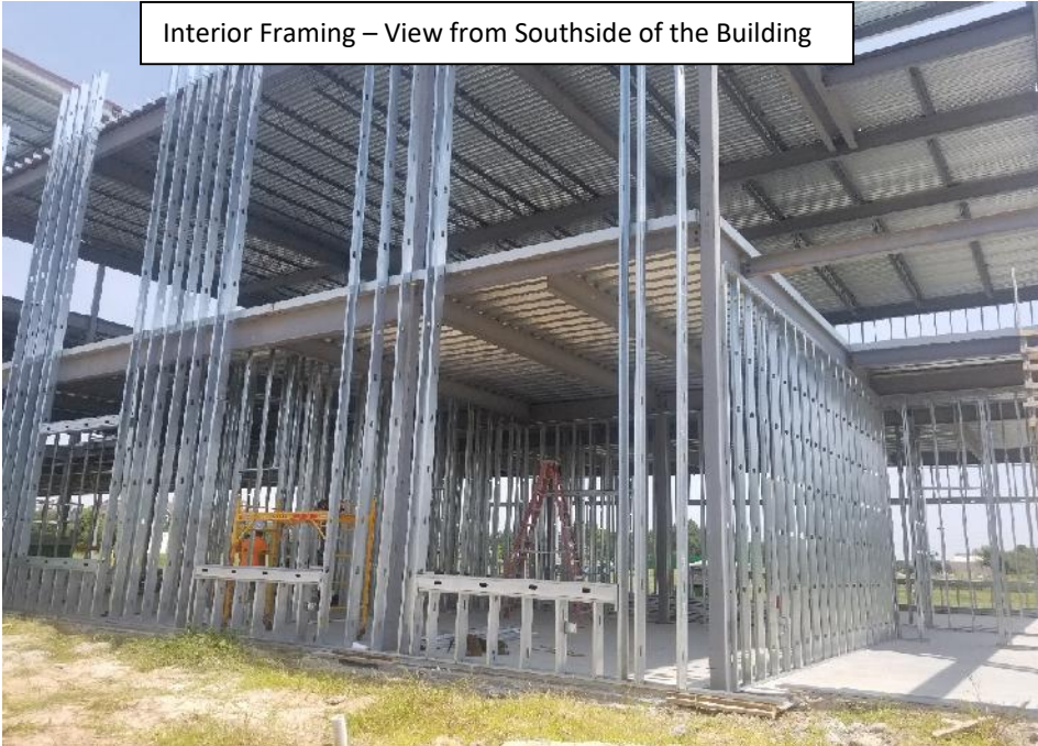
Interior Framing – View from Southside of the Building